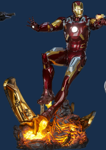
IRON MAN MARK VII

XM STUDIOS IS EXCITED TO PRESENT MARVEL PREMIUM COLLECTIBLES SERIES STATUE, CABLE! THE TIME TRAVELLING MUTANT IS IMMORTALIZED IN AMAZINGLY DETAILED 1:4 SCALE COLD-CAST PORCELAIN. AN XM EXCLUSIVE FOR 2016, THE BROODY SUPER HERO BRANDISHING HIS POWER WEAPONRY FROM THE FUTURE.