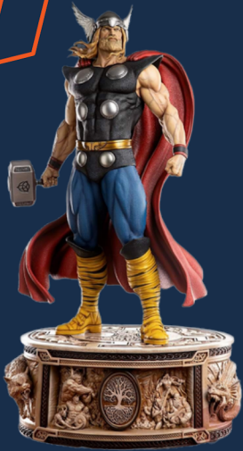
THOR: PRESTIGE SERIES