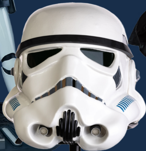
RS PREP MASTERS Stormtrooper Helmet A New Hope

THE DISTINCTIVE DESIGN OF THE STORMTROOPER WAS ORIGINALLY CREATED BY CONCEPT ARTIST RALPH MCQUARRIE IN 1975.